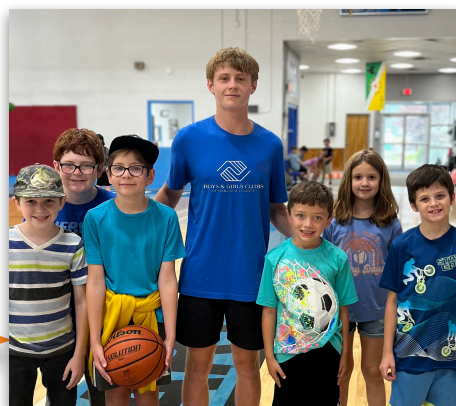
Experience Memories of a Lifetime at BGCHC Summer Camp!